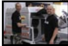
Pioneer was out in full force with their competition team.