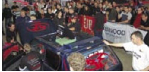
France, Norway and Greece had great support from the competitors and manufacturers alike.